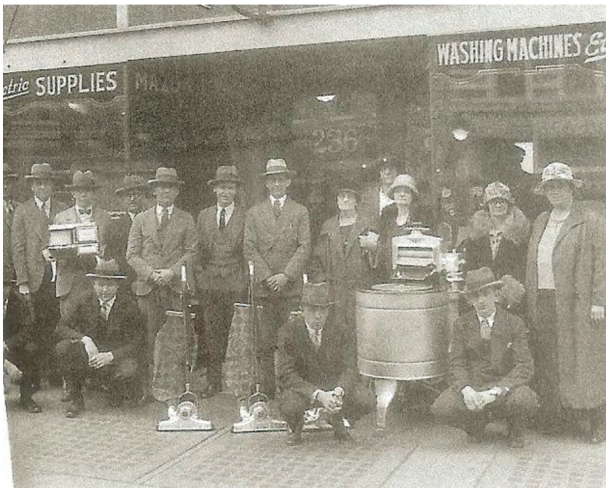
A photograph of sales staff taken in the early 1920s.

13 Look at the photograph, and then answer the questions which follow.