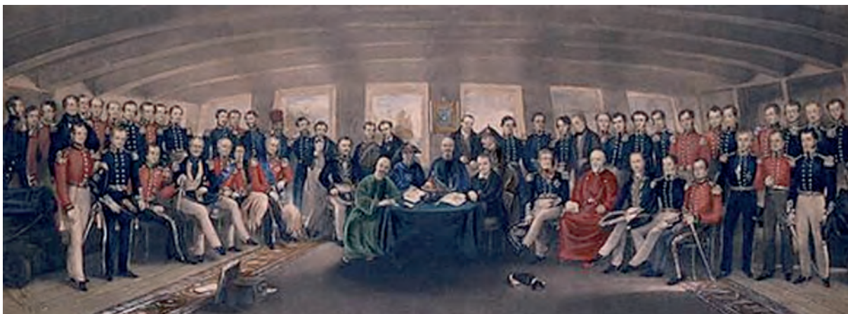
The signing of the Treaty of Nanking in August 1842. It marked the end of the First Opium War in which China suffered military defeat.

24 Look at the picture, and then answer the questions which follow.